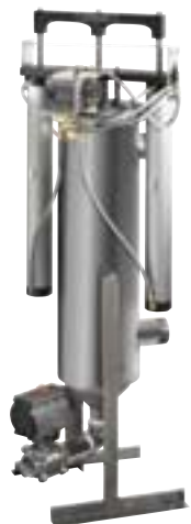
Mechanically Cleaned Filters