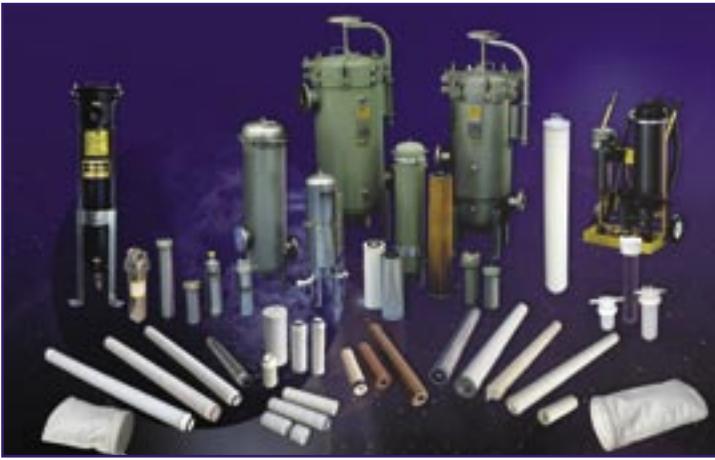
Parker Process Advanced Division