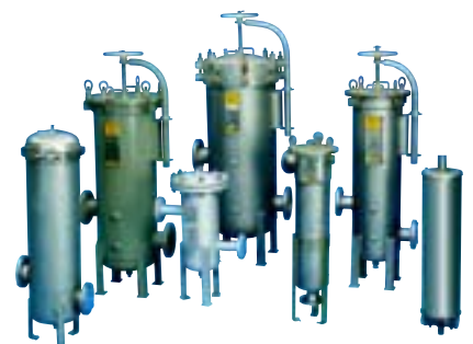
Parker Process Advanced Division