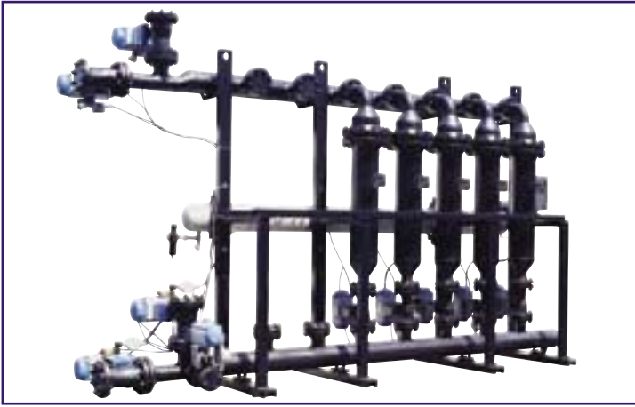
RPA Process Technologies