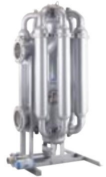
Back Washable Filters